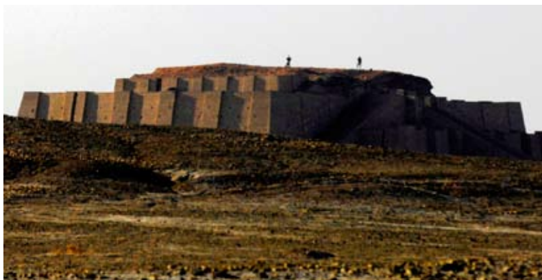
The Great Ziggurat was built as a place of worship, dedicated to the moon god Nanna in the Sumerian city of Ur in ancient Mesopotamia. Today, after more than 4000 years, the ziggurat is still well preserved in large parts as the only major remainder of Ur in present-day southern Iraq.

These considerations should cause us to approach the ancient Egyptian Pyramid Texts with an awareness that, although they appear concerned with the fate of the soul after death, they may belong to a similar mystical tradition to the Mesopotamian Akitu, and that the experiences the pharaoh underwent were regarded as benefiting the whole country. According to this mystical tradition, in crossing the threshold that separates the world of the living from the realm of the dead, a connection was made with the vitalizing energies that are mediated by the dead into the world of the living.