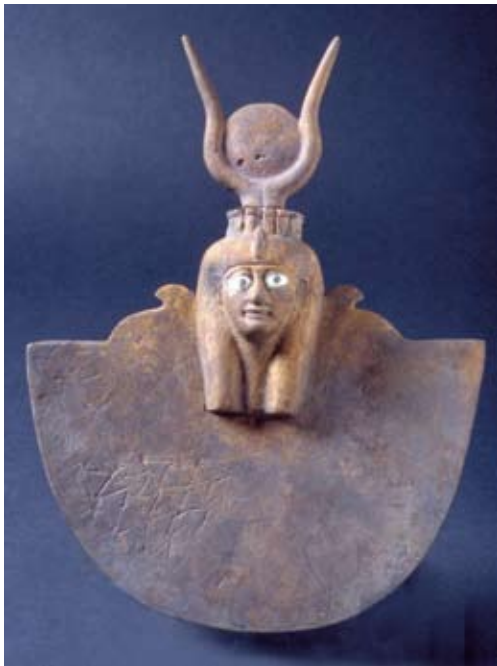
Iron Isis Finial, 525-332 BCE. Finials were the tops of staves used in Temple Processions to mark the location of important officials. The Isis Mysteries spread throughout the Mediterranean and became the most widespread mystery tradition of the Egyptian-Greco-Roman world. From the Collection of the Rosicrucian Egyptian Museum.

While the broad course of events that took place at Eleusis is fairly well known, much less is known of the details of what actually occurred in the mysteries, because the initiates were sworn to secrecy. We do know, however, from Aristotle, that what happened to the initiates was not that they gained some kind of intellectual understanding, but rather that they had a transformative experience that had a strong emotive charge. Aristotle writes that initiates were “not expected to learn something but to experience emotions and a change in the state of mind ( diatethenai ).” 4 From other ancient writers we have cryptic statements indicating that participation in the mysteries conferred on the initiates a blessing that set them apart from the uninitiated, particularly in a changed