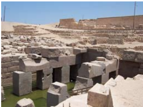
Ruins of the Osireion at Abydos, site of the ancient Mysteries of Osiris.