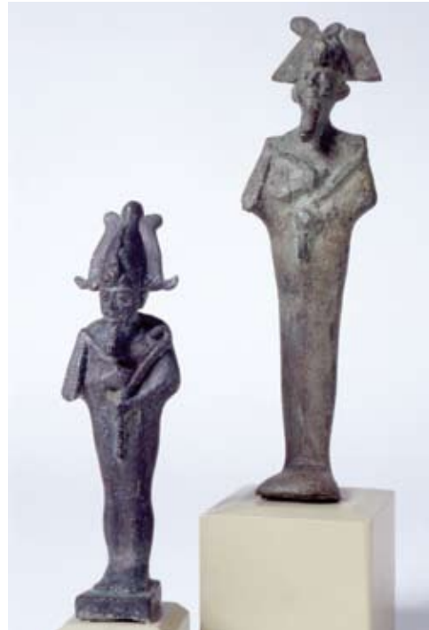
Bronze Osiris Images, 525-332 BCE. The God Osiris was dismembered by Set and then raised from the dead by his wife Isis, and together with their son Horus are the focus of the very early Osirian Mysteries of Egypt. From the Collection of the Rosicrucian Egyptian Museum.

The rites celebrated at Eleusis fell into three parts. 3 The "lesser mysteries" were